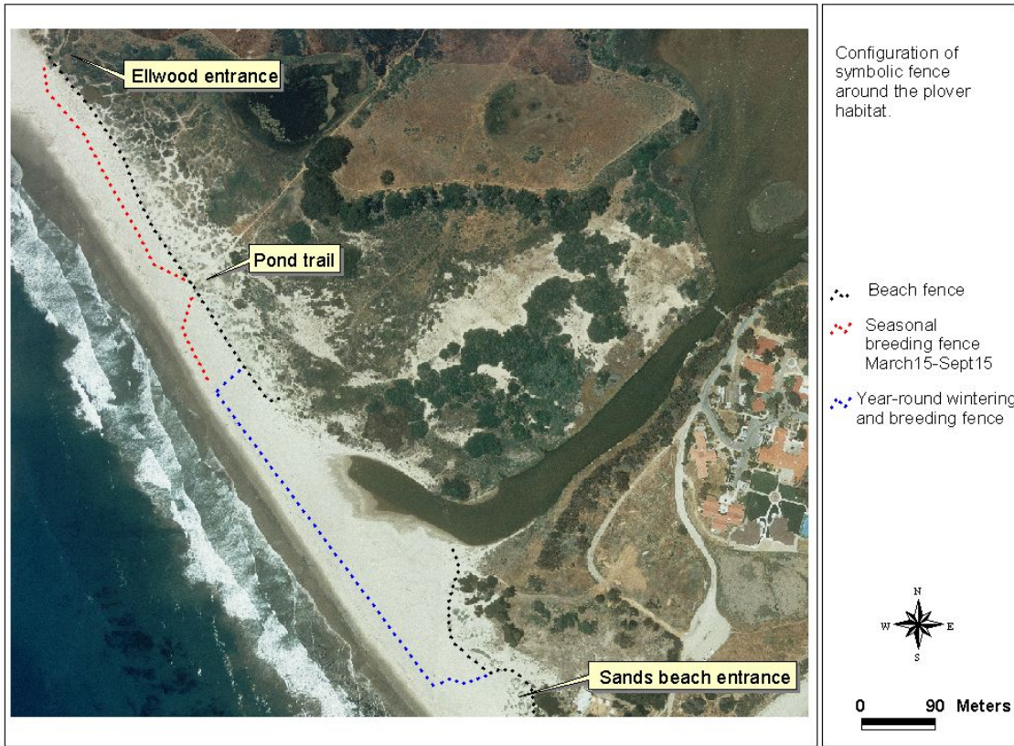
Figure 1. Location of the habitat protected for the Western Snowy Plovers on Sands beach at Coal Oil Point Reserve.