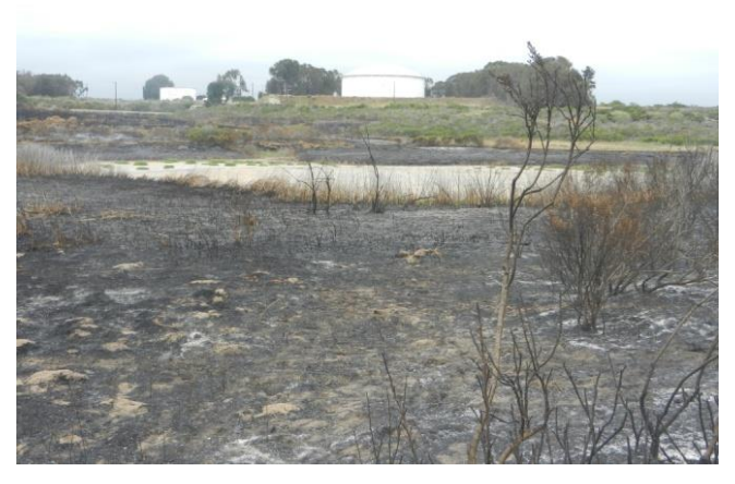
June 30 2014

some respects. The reserve had not burned for several decades and the vegetation had accumulated dead brush. The fire cleaned up much of the fuel and regenerated the vegetation. We were impressed at how fast the natural vegetation grew back, even in a record dry year and before the rain had started. The fire has also created new opportunities for research on fire ecology and allowed us to better understand the landscape.