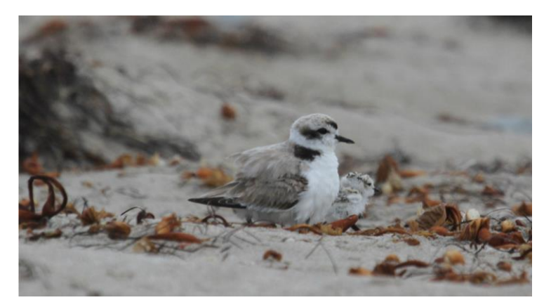
Western Snowy Plover

We would like to thank the Snowy Plover Docents for all of their hard work throughout the year. The plovers face a host of natural threats on the beach. By giving them space to feed and nest peacefully, we reduce the challenges that they must face on a daily basis.