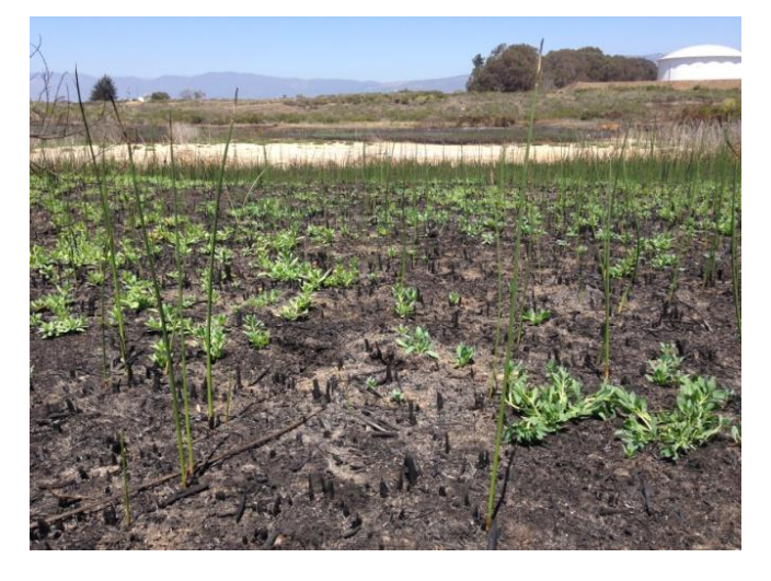
August 4 2014