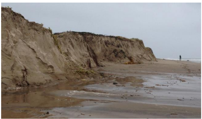
Erosion of the dunes from the March storm. Note the height of the person and the eroded dunes

On March 1<sup>st</sup>, large storm waves coincided with an extreme high tide and caused massive erosion at Sands Beach. A 15 ft high cliff was formed that divided the beach and the dunes. The surge was so strong that the next day, kelp was found on top of the bluff 30 ft. above the beach.