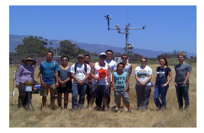
Geography 175 Class Visit

different years. All field observations, which are typically collected in the spring during several field trips, and have been collected in 2008, 2011 and 2013, are made accessible to current classes. Thus the students of 2015 can draw upon historical data collected by past classes to answer new questions, further enhanced by more than seven years of instrumental observations. 2015 promises to be particularly exciting as we enter the fourth year of the worst drought in California in over a century and students can directly determine how the drought has impacted the kinds of plants they find, their abundance and the timing of key events such as germination, flowering, fruiting and senescence. The small fire that burned half of the field plots in 2014 at Coal Oil Point adds another interesting opportunity for student research, while the impact of long term restoration efforts can be further studied.