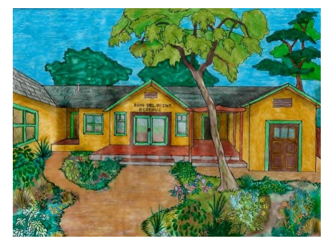
Drawing of future education center by Lauren Dykman

The vision of the new Education Center for Coal Oil Point Reserve is now a reality. The Center will support environmental education and research for all ages through classes, tours, volunteerism, and