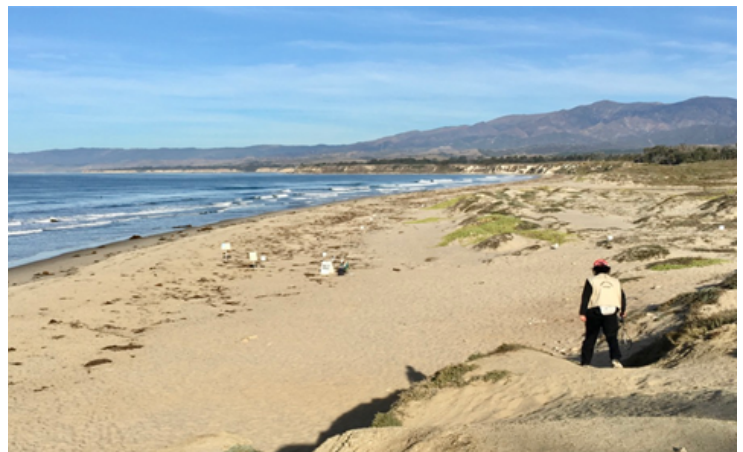
Figure 4. Sands Beach during spring months.