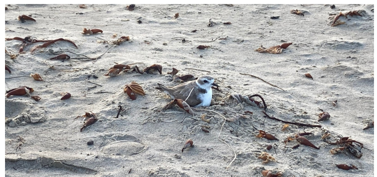
Female plover incubating fake wooden eggs in nest.