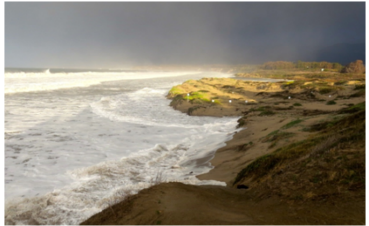
Figure 3. Sands Beach inundated during a winter storm event.

oriented management strategies. The delicate balance of conservation and recreation which enables snowy plovers to thrive at COPR could not occur without the tireless dedication of staff, students, volunteers and community members. Their outstanding efforts to help protect snowy plover habitat through advocacy, education, and outreach are the key to maintaining this extraordinary space for humans and plovers alike.