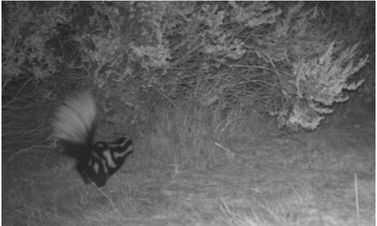
The first ever documentation of spotted skunk on the reserve was this camera trap photo on August 4th, 2021.