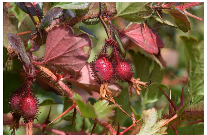
Gooseberry ( Ribes speciosum ) in fruit.

As we look forward to the new year, I am excited to soon have student volunteer groups returning to the reserve to help with restoration projects and to see what else shows up on our camera trap images.