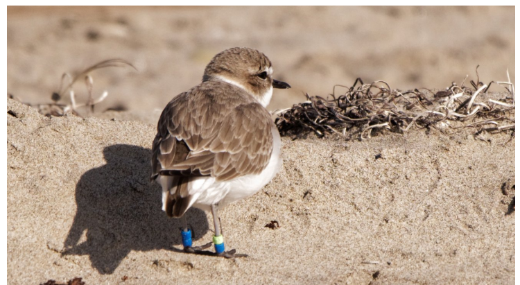
Banded plover, bb:lb, aka "Bubbles".

It isn't anyone who would be filled with joy after a good day's effort at collecting Snowy Plover color band data, but I am one of those who is. I love it, and I know how valuable the data is, and besides, what better work environment could one ask for?