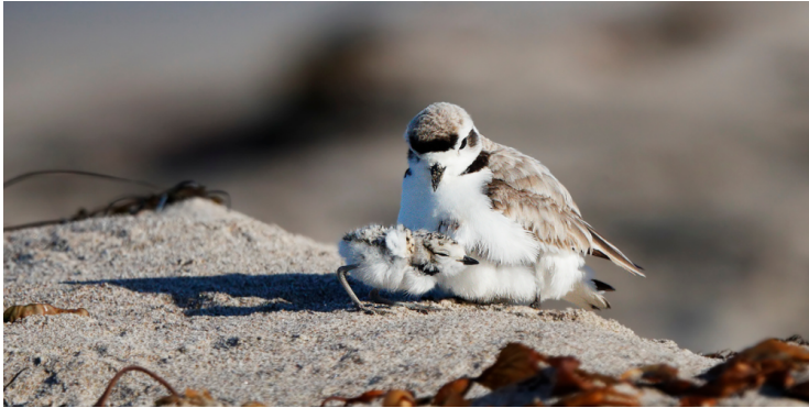
Western Snowy Plover with chick.

I always found Western snowy plovers adorable. Their tiny fluffy bodies and quick-legged running style are just some of the characteristics that make them so charming. As an incoming master's student at the Bren School for Environmental Science & Management at UCSB, I could not have been happier to discover Coal Oil Point Reserve's Snowy Plover Program. I first began interning at the Reserve last fall working on reorganizing and recreating a database for the Reserve using a few large clearing house databases like the Global Biodiversity Information Facility (GBIF) and the California Consortium of Herbaria (CCH2). The newly reorganized data housed on the Reserve database will be used for future research projects at the university and promote similar methods for compiling and organizing natural history data within the UC Natural Reserve System. Throughout the fall, I collected data from different databases, growing my skillset to properly clean data, code in different languages, and use a suite of software systems. The knowledge I gained from data analysis classes helped me understand how to apply these skills to real-world applications.