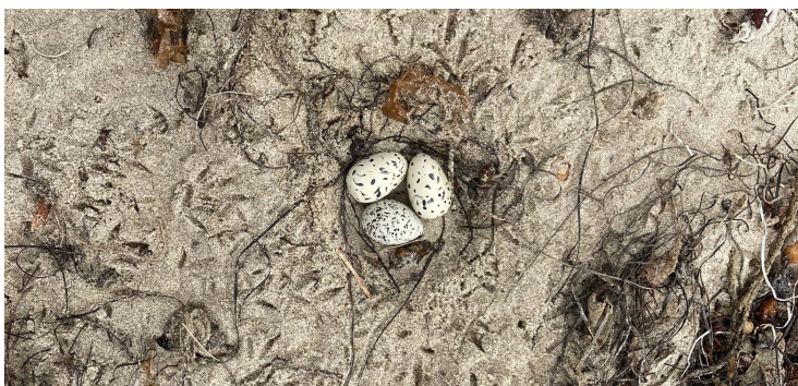
Egg replacement in nest: 2 fake eggs (top), 1 real egg (bottom)