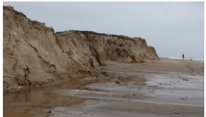
Erosion of the dunes from the March storm. Note the height of the person and the eroded dunes

The old sea wall on Ellwood beach broke apart and the boards piled up at the mouth of Devereux Slough. We removed 150 boards to avoid the impacts of leaching of toxic pollutants found in these boards. These types of unusual but large events sometimes shape the landscape for years to come. I watched from my deck at home as a series of gigantic waves rolled over the slough mouth and into the dunes. When they retreated, about 1 acre of vegetated scrub floated away into the ocean as if someone had cut out a piece of the landscape.