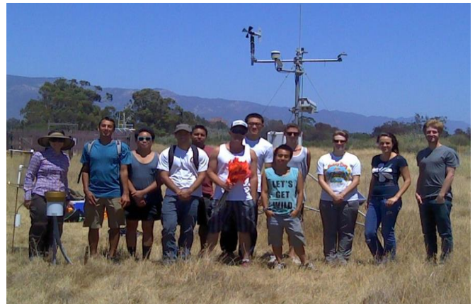
Geography 175 Class Visit

different years. All field observations, which are typically collected in the spring during several field trips, and have been collected in 2008, 2011 and 2013, are made accessible to current classes. Thus the students of 2015 can draw upon historical data collected by past classes to answer new questions, further enhanced by more than seven years of instrumental observations. 2015 promises to be particularly exciting as we enter the fourth year of the worst drought in California in over a century and students can directly determine how the drought has impacted the kinds of plants they find, their abundance and the timing of key events such as germination, flowering, fruiting and senescence. The small fire that burned half of the field plots in 2014 at Coal Oil Point adds another interesting opportunity for student research, while the impact of long term restoration efforts can be further studied.