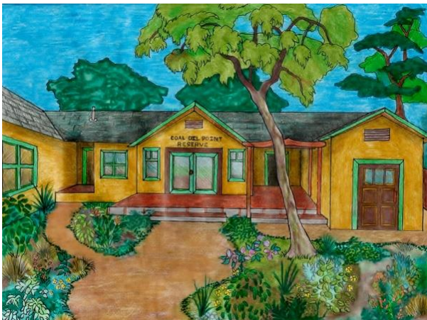
Drawing of future education center by Lauren Dykman

The vision of the new Education Center for Coal Oil Point Reserve is now a reality. The Center will support environmental education and research for all ages through classes, tours, volunteerism, and