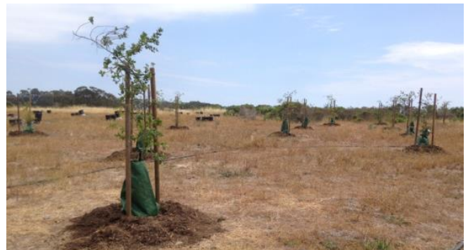
Oak Tree Plantings

Coal Oil Point Reserve collaborated with the local non-profit Goleta Valley Beautiful to plant 150 Coastal Live Oak trees on the northwest corner of the reserve. The project is part of a long term goal to create a wildlife corridor connecting protected habitats and freshwater resources within the Devereux watershed. The vegetated corridor will reduce the effect of habitat fragmentation and facilitate movement of wildlife across the adjacent open space areas.