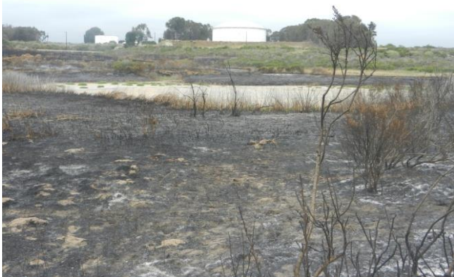
June 30 2014

On March 1 st , large storm waves coincided with an extreme high tide and caused massive erosion at Sands Beach. A 15 ft high cliff was formed that divided the beach and the dunes. The surge was so strong that the next day, kelp was found on top of the bluff 30 ft. above the beach.