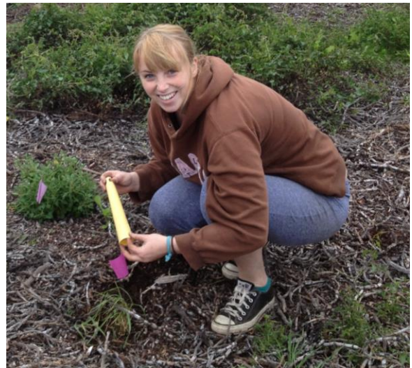
Hillary graduated from UCSB in the spring of 2014 with a BA in environmental studies and a minor in English

kids viewed the reserve and their natural environment as a whole.