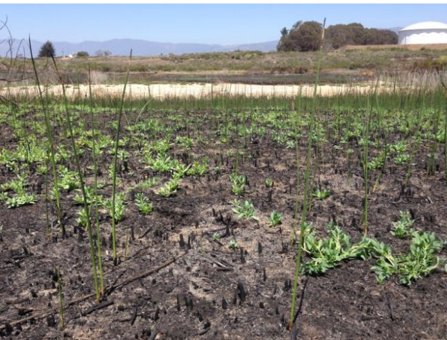
August 4 2014